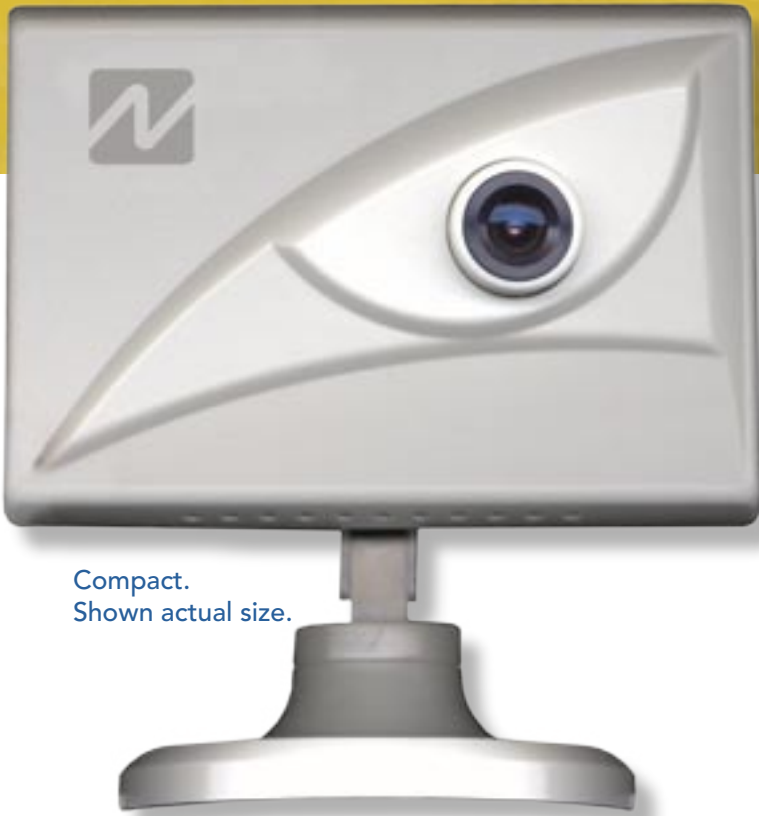
Compact. Shown actual size.